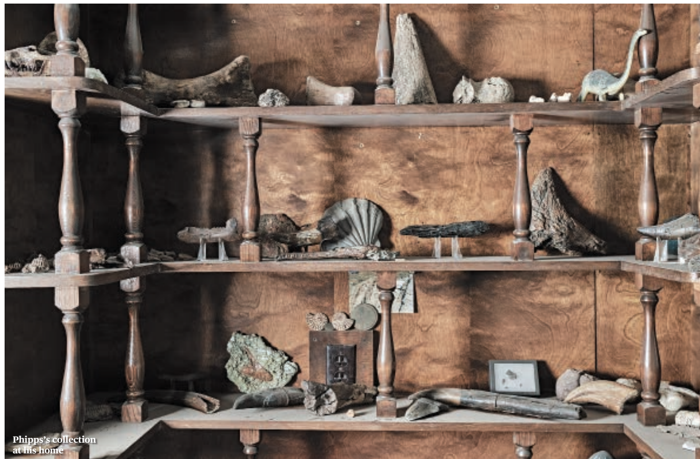
Phipps's collection at his home

The tension between concern for profit and concern for preservation plays out at times on Dino Hunters , whose first season aired in the summer of 2020, drawing 8 million viewers over its six episodes. Phipps and other ►